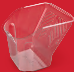
8629 PELICAN LINER 3-PACK